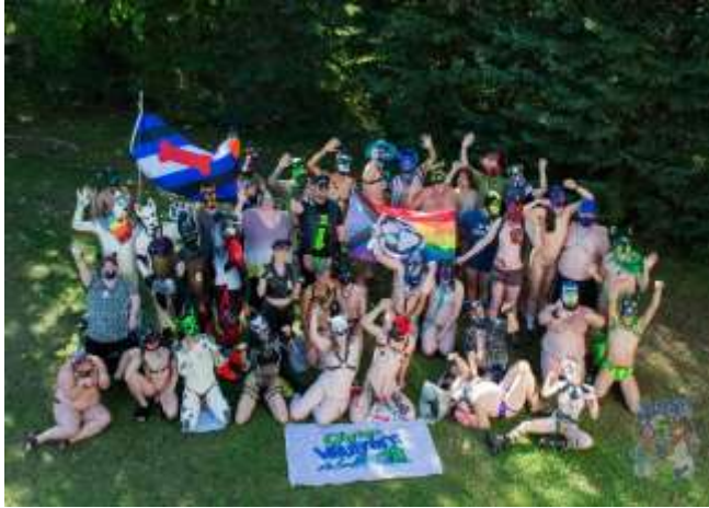
1Camp 2023 Group Photo

On behalf of Wruffin’It Adventures Group, we’d like to welcome you to your 6 th annual Camp Wruffin’It!